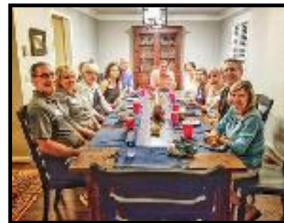
Table is an opportunity to share a meal with friends old and new. The Mullaney family hosts these monthly meals at their home for 10 adults (and their children). The Mullaney's provide the main dish and guests bring sides, drinks, or dessert. These gatherings serve as great opportunities to bring together a diverse group of people for food and fellowship.

Look for sign up sheets in the Narthex in August and September.